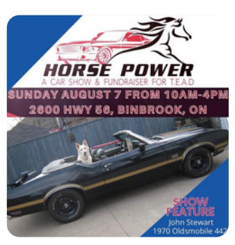
Horse Power Car Show Thank you for raising funds for TEAD