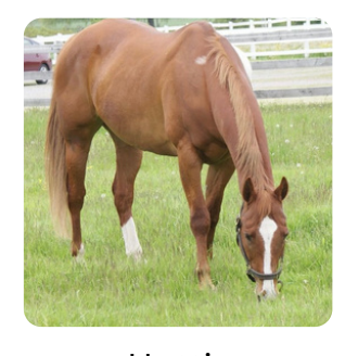
Hottie *retired in 2022