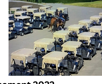
Golf Tournament 2022 An amazing day on the greens in support of TEAD