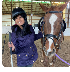
Lady new in 2022