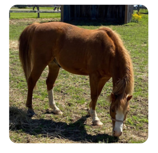
Opie new in 2022